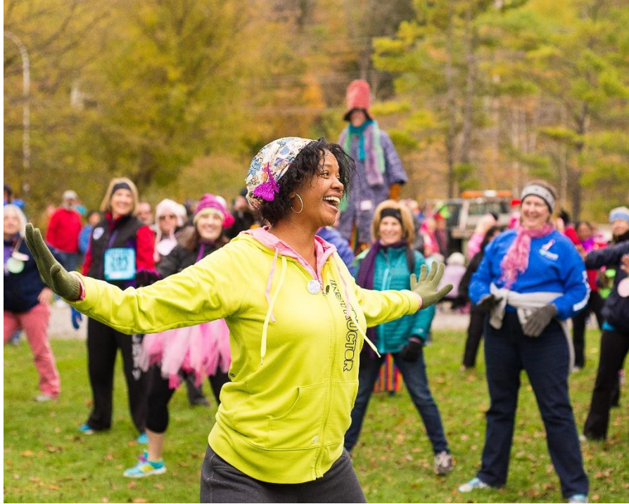
At the Walkathon & 5K Run!