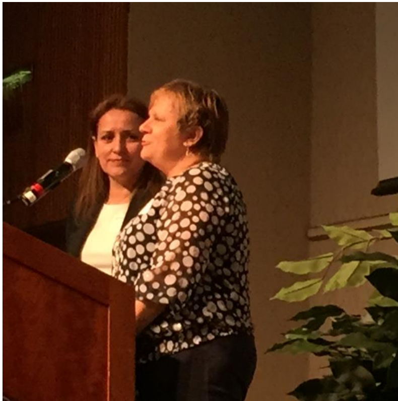
Receiving an award from the Women's Fund of the Community Foundation of Tompkins County to provide wigs to low-income women with cancer-related hair loss