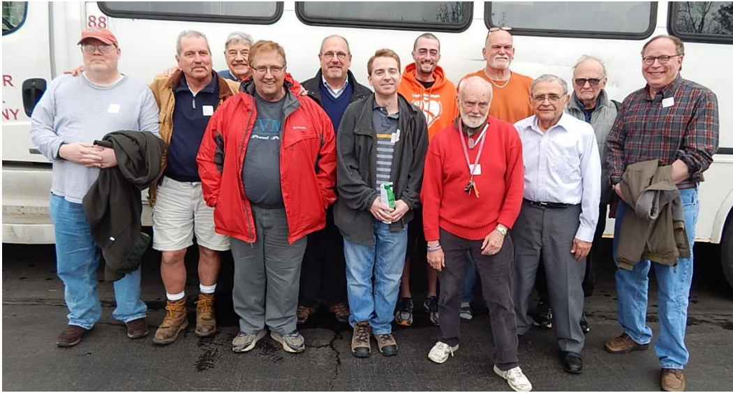
The Men's Adventure Day