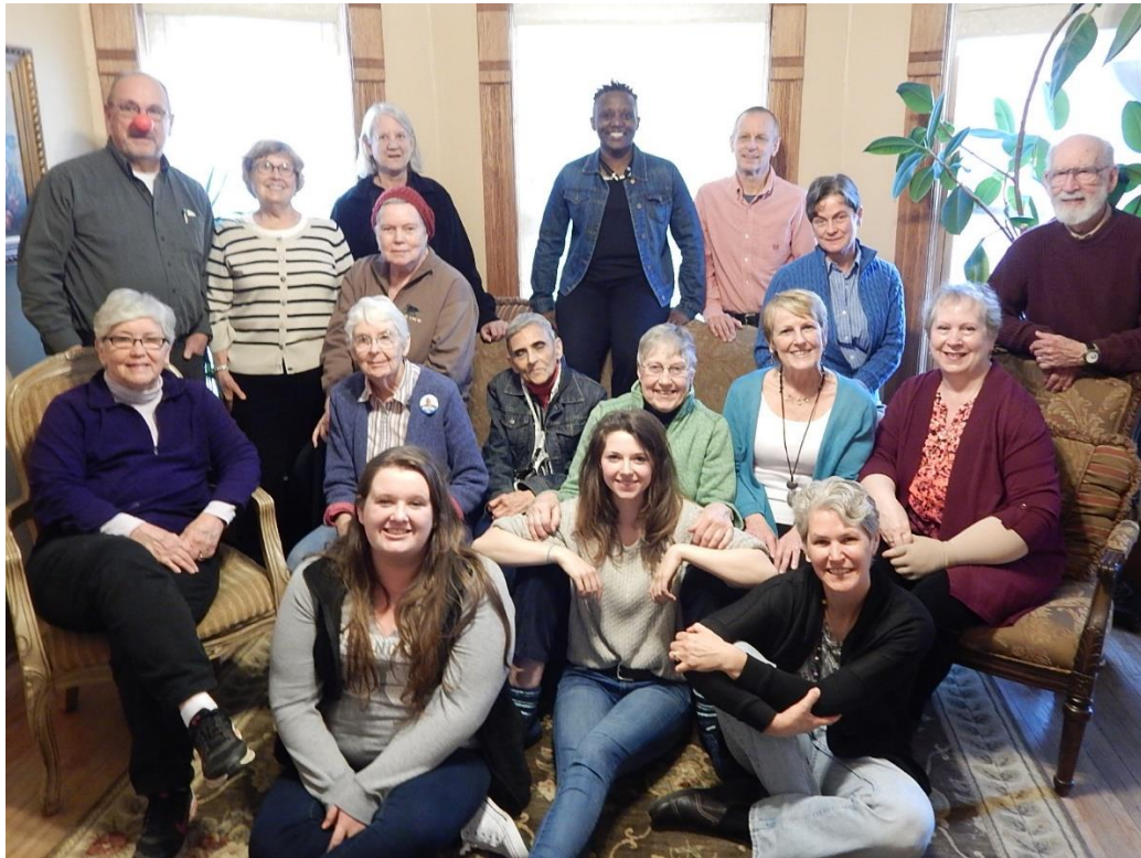
Some of our volunteers