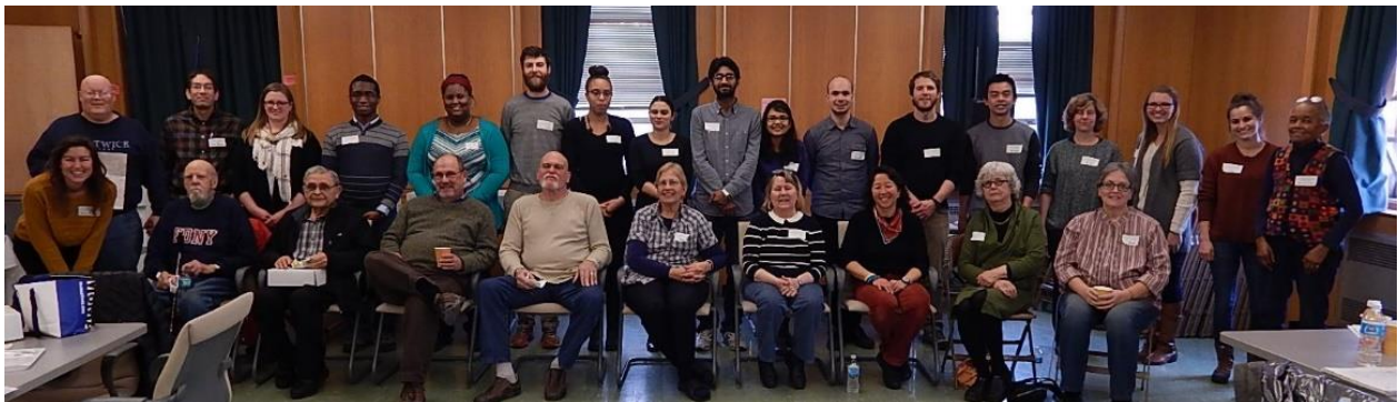
CRC Clients and cancer researchers at Cornell at a weekend workshop