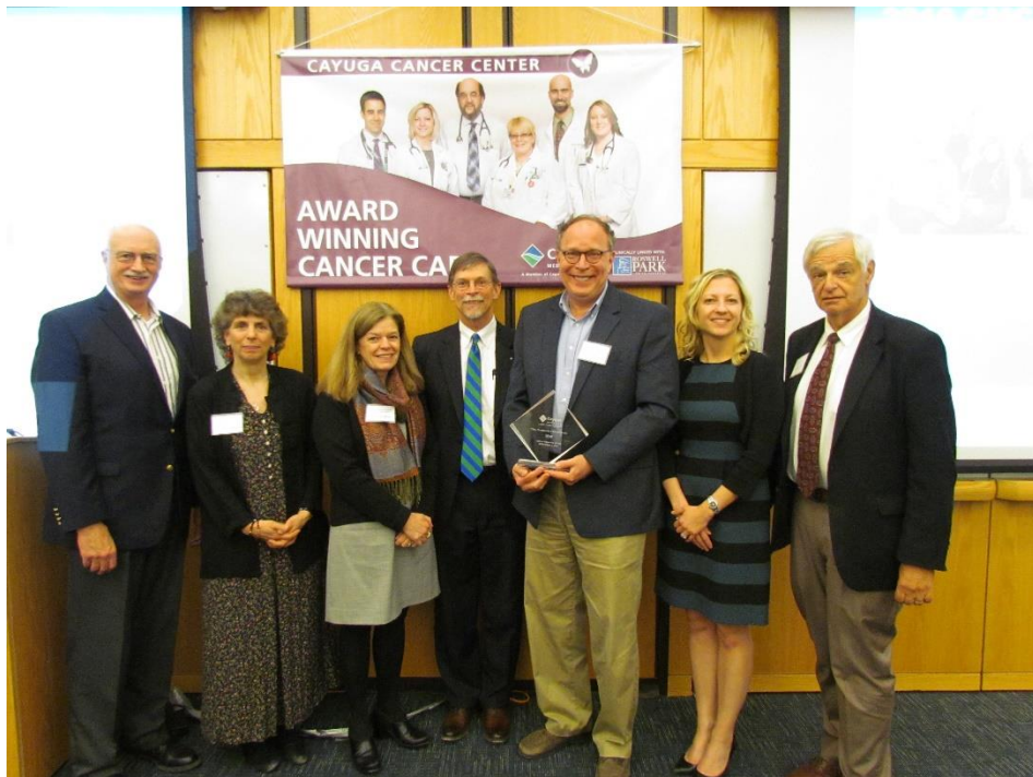
Receiving the Community Partner Award from Cayuga Medical Center